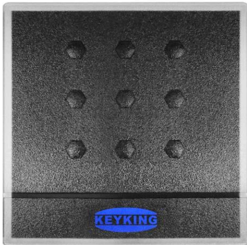
6609E-4 (Proximity Reader)